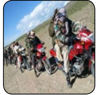
through in the operations. Kohistanat district fell to insurgents nine days back.